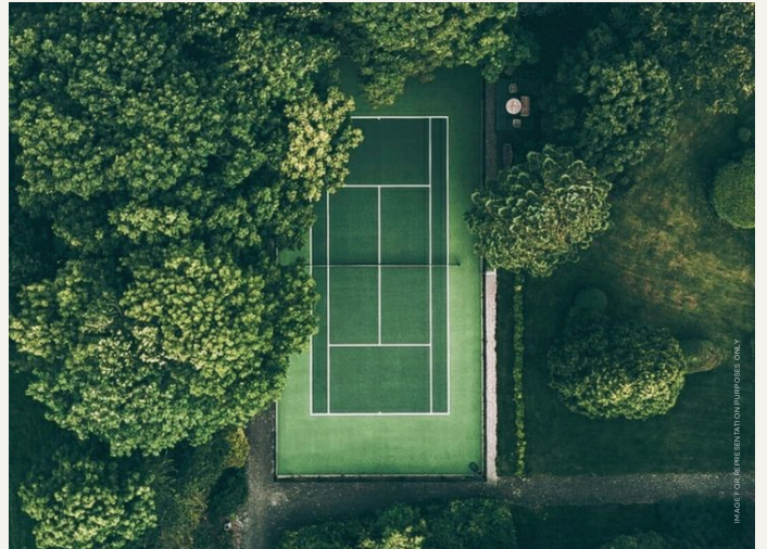
TOURNAMENT-GRADE TENNIS COURTS

And many more amenities designed to effortlessly elevate your new lifestyle at Embassy Serenity.