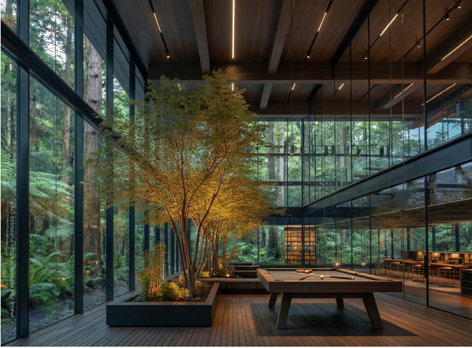
STATE-OF-THE-ART CLUBHOUSE DECKED WITH AMENITIES