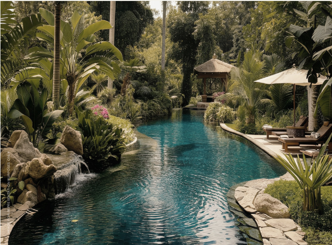
SWIMMING POOL THAT CENTRES THE LANDSCAPE