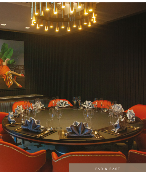
FAR & EAST