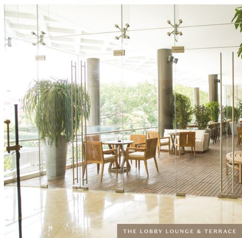
THE LOBBY LOUNGE & TERRACE