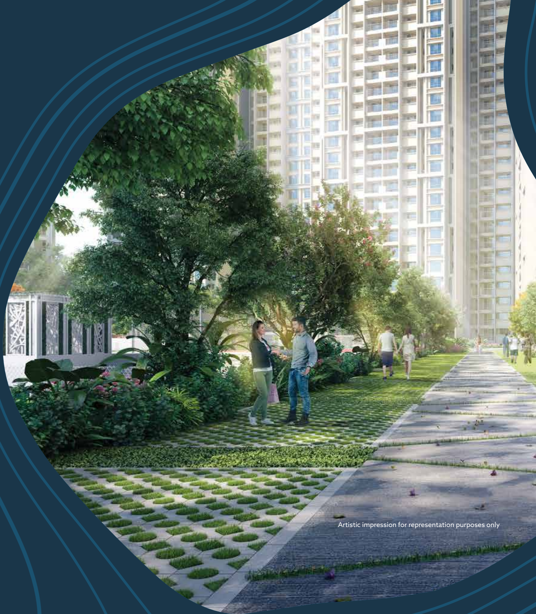
Artistic impression for representation purposes only

A thriving, self-sustained community designed for growth and ease.