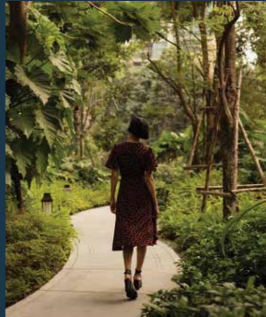
Landscaped gardens & walking trails