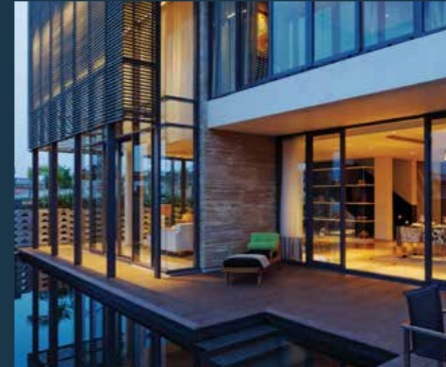
EMBASSY BOULEVARD, NEAR KIAL, BENGALURU

At the heart of Bengaluru's IT capital - An address that has it all