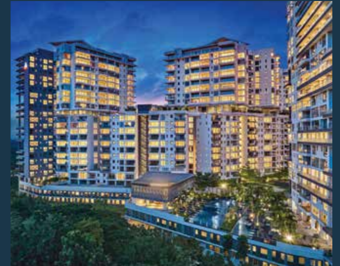
EMBASSY LAKE TERRACES, HEBBAL, BENGALURU

Ultra-luxury gated villa community designed by Andy Fisher Workshop, Singapore.