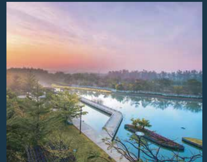
EMBASSY SPRINGS, NORTH BENGALURU

Ultra-spacious villaments overlooking the KGA Golf Course.