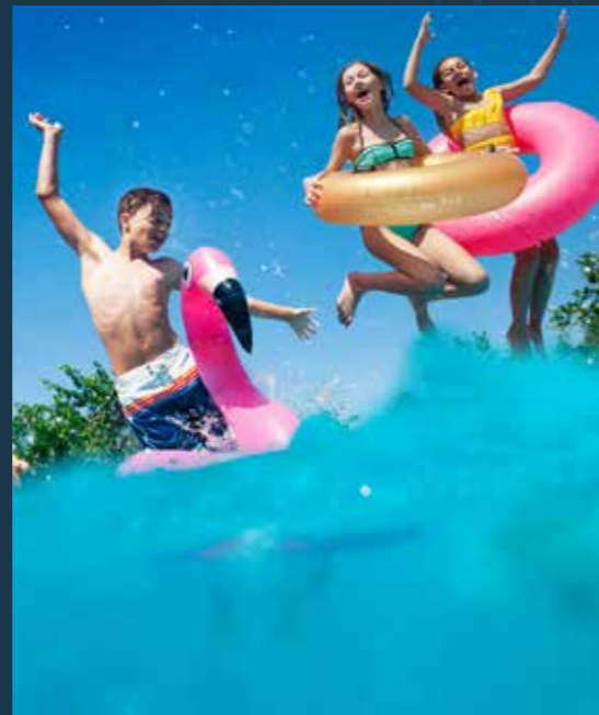
Swimming pool & kids' pool