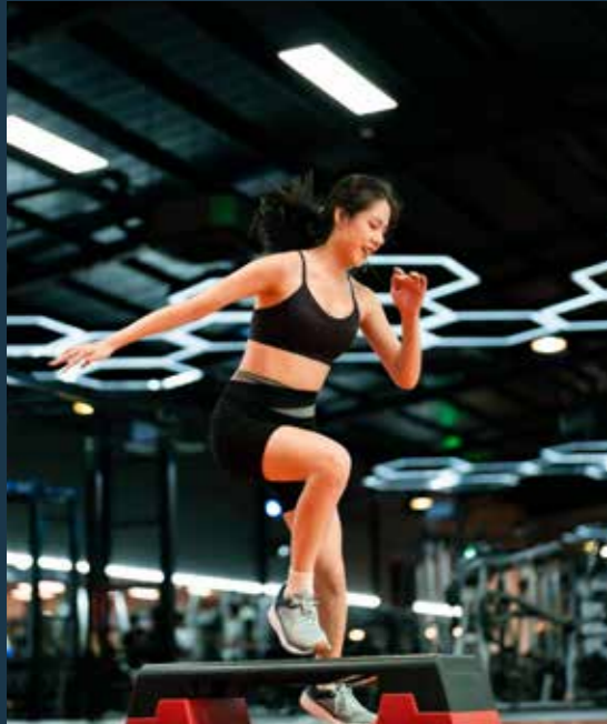
Fitness center & indoor gym