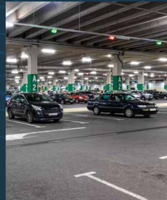
Ample parking & 24x7 security