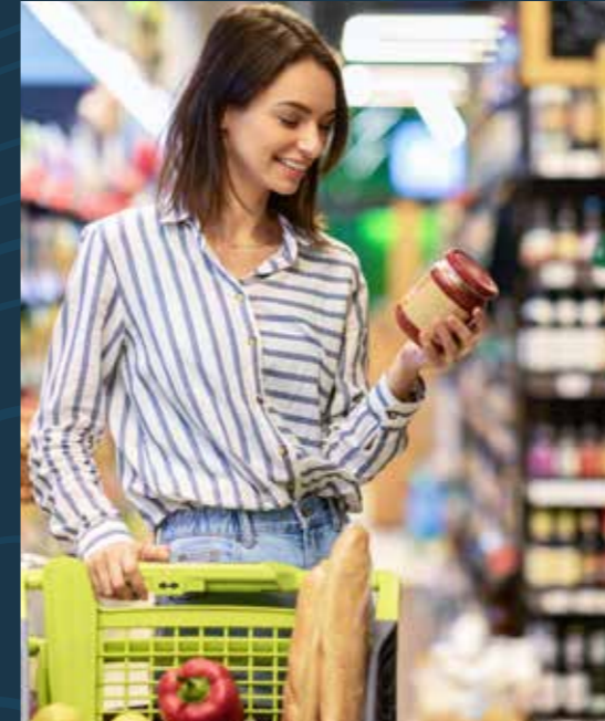
Retail & convenience stores within the community