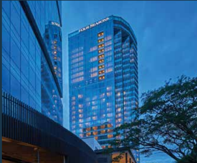
FOUR SEASONS PRIVATE RESIDENCES AT EMBASSY ONE, MEKHRI CIRCLE, BENGALURU

India's first Four Seasons Private Residences, managed by Four Seasons.