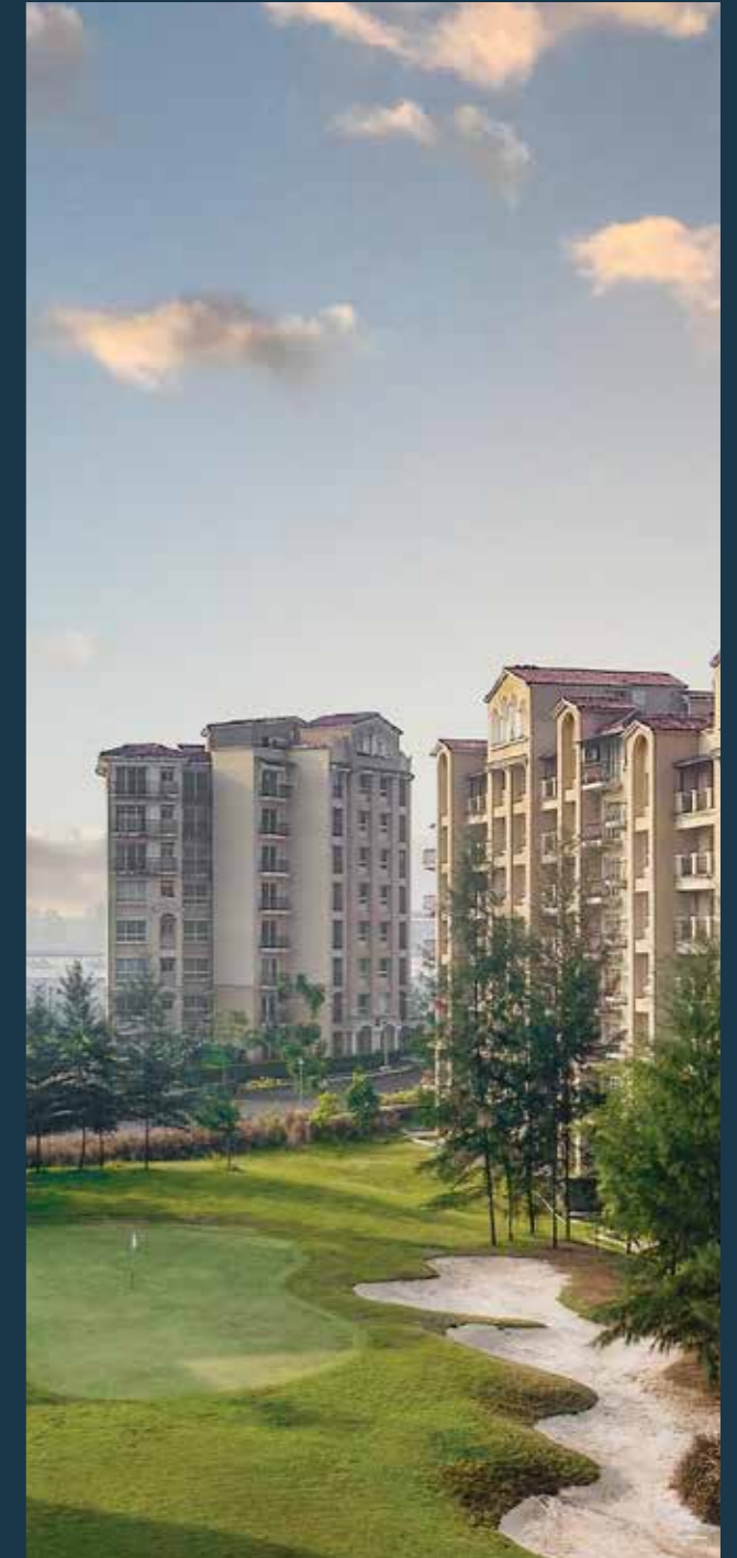
GOLF CITY, SAVROLI

The most exclusive address with panoramic sea views.