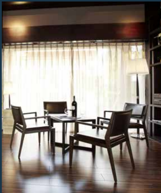
Clubhouse with multipurpose halls