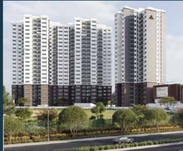
EMBASSY EAST AVENUE, WHITEFIELD, BENGALURU

India's first Four Seasons Private Residences, managed by Four Seasons.