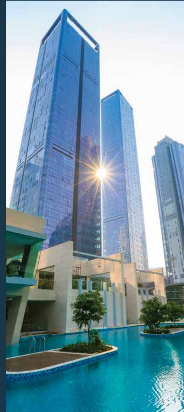
BLU ESTATE AND CLUB, WORLI, MUMBAI

Premium residences in the heart of Thane, at Pokhran Road 2