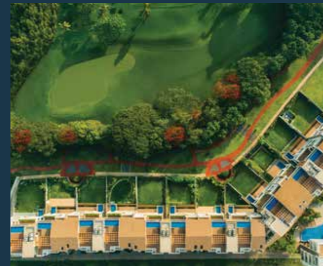
EMBASSY GROVE, AIRPORT ROAD, BENGALURU

Nature inspired homes in Phase-1, with 1,044 residences across three towers in 1, 2, 2.5 and 3 BHK formats.