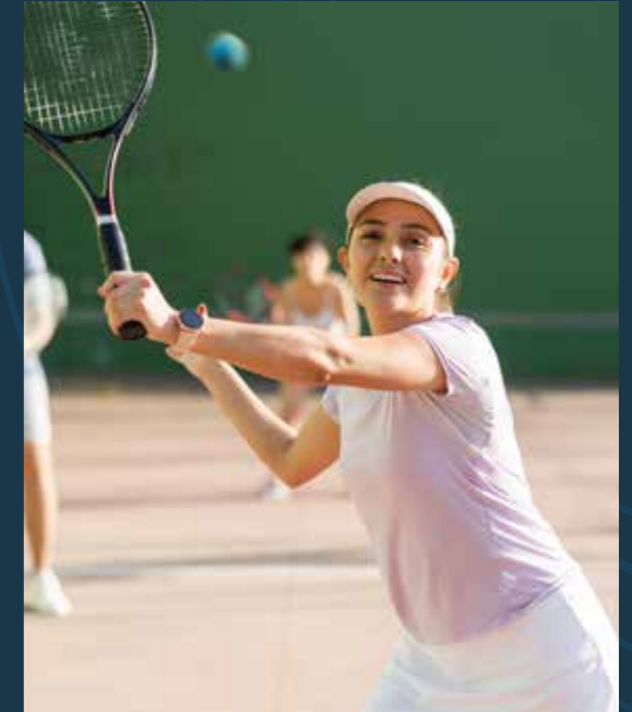
Outdoor sports courts & play zones