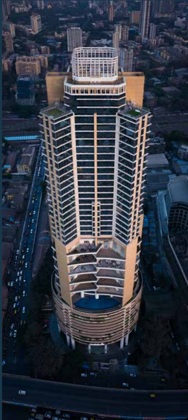
SKY AND SKY FOREST, LOWER PAREL, MUMBAI

Iconic architectural landmark on Mumbai's Golden Mile with sea views.