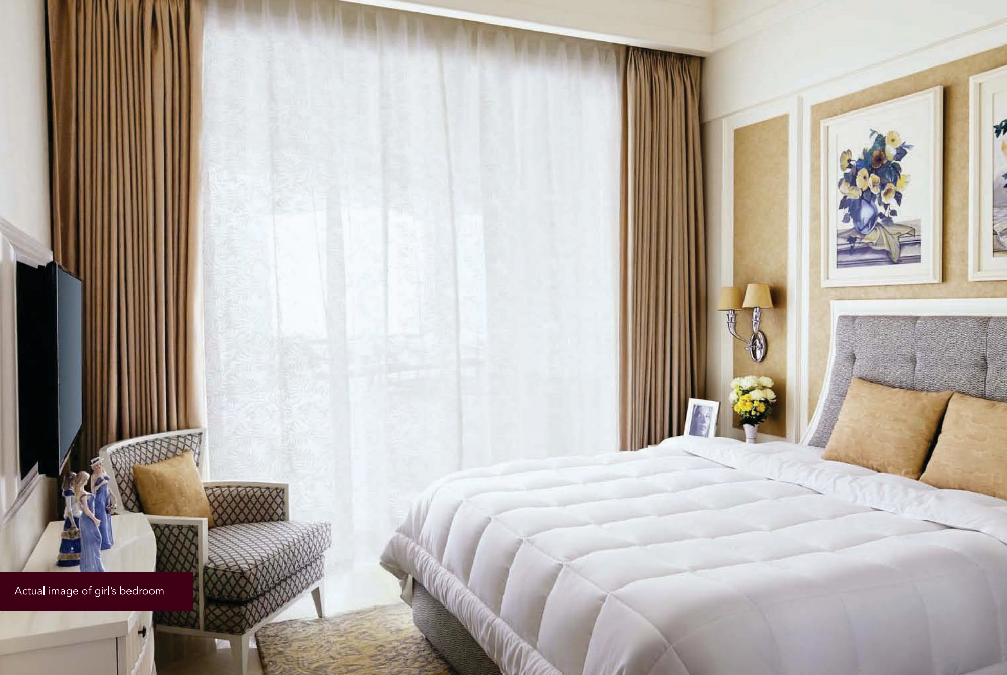
Actual image of girl's bedroom