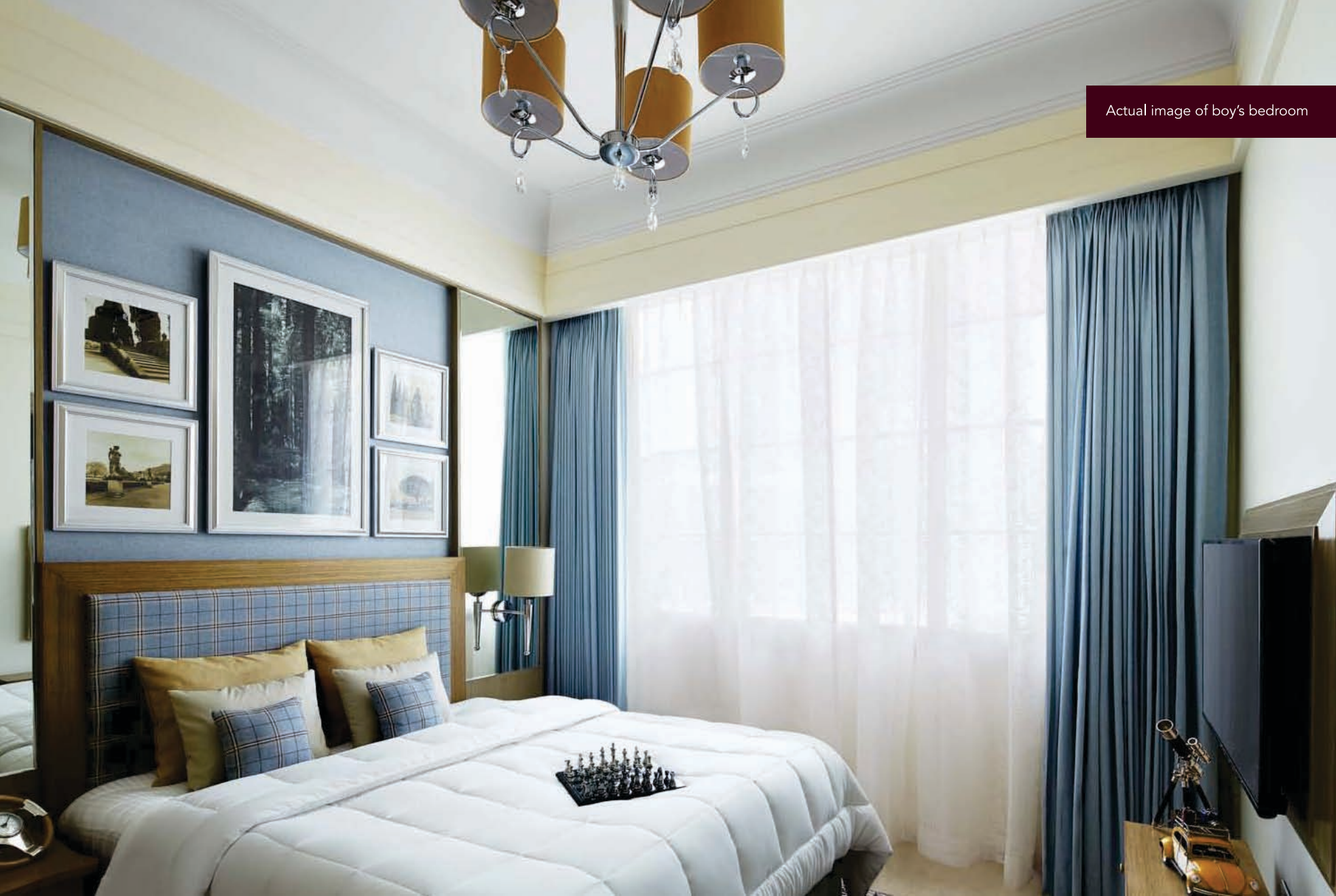
Actual image of boy's bedroom