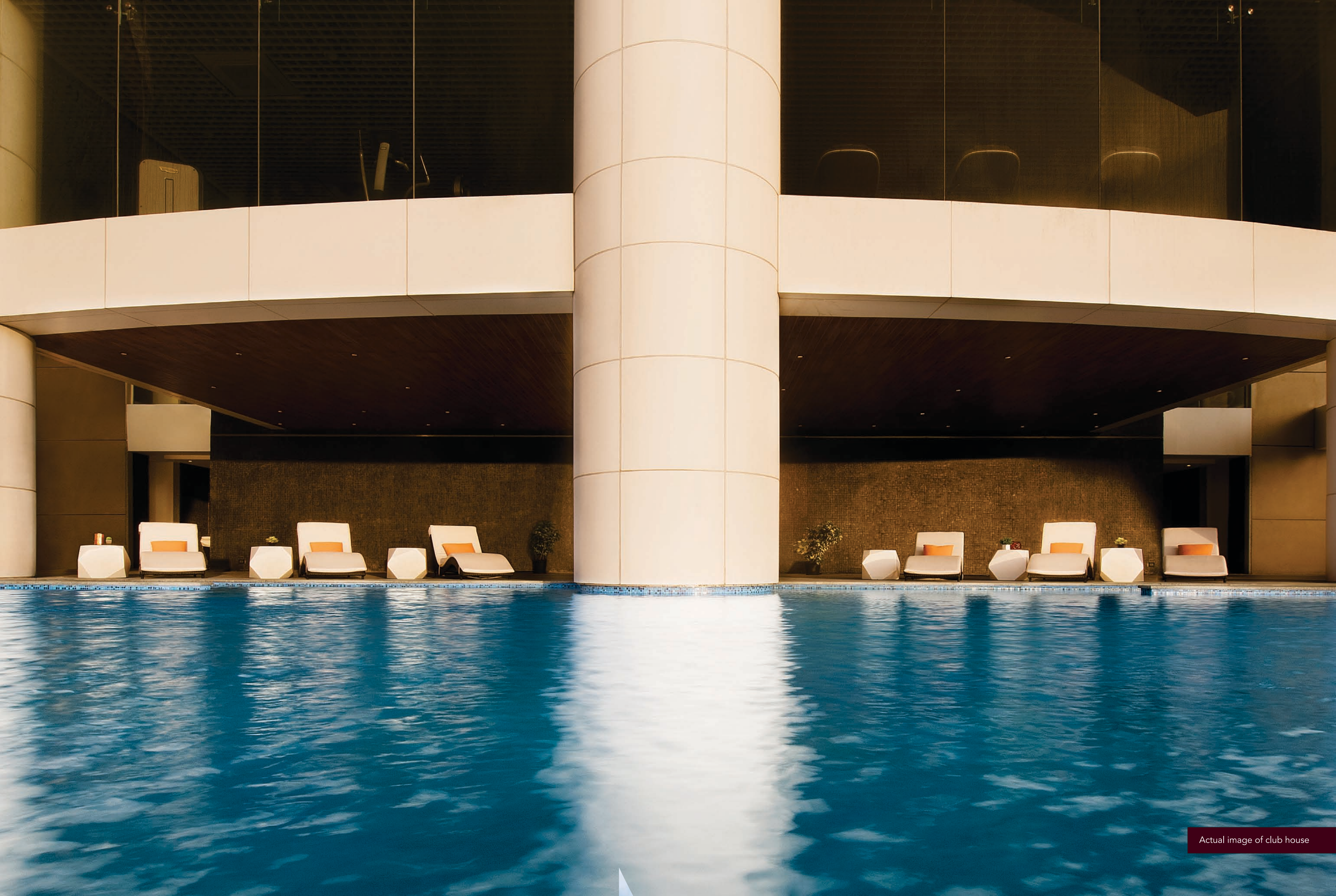
Actual image of club house