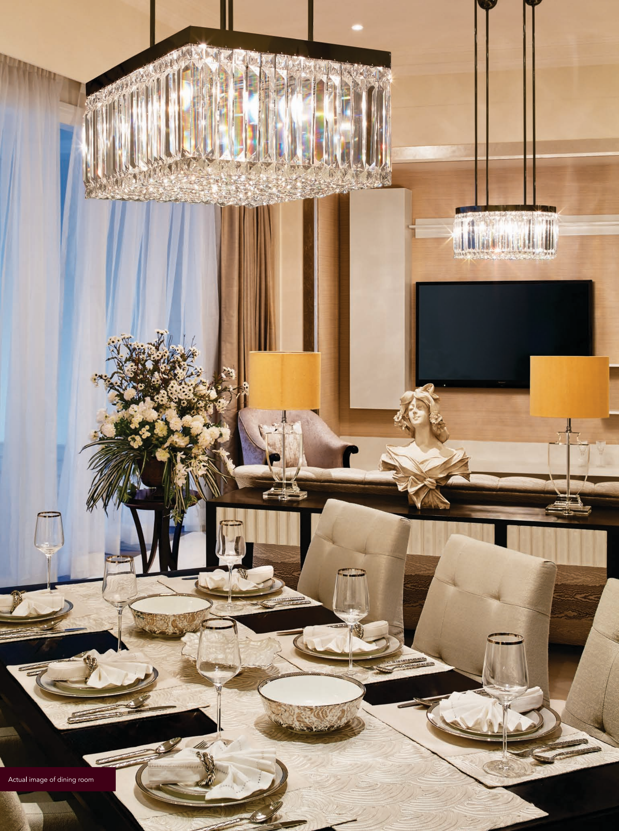
Actual image of dining room