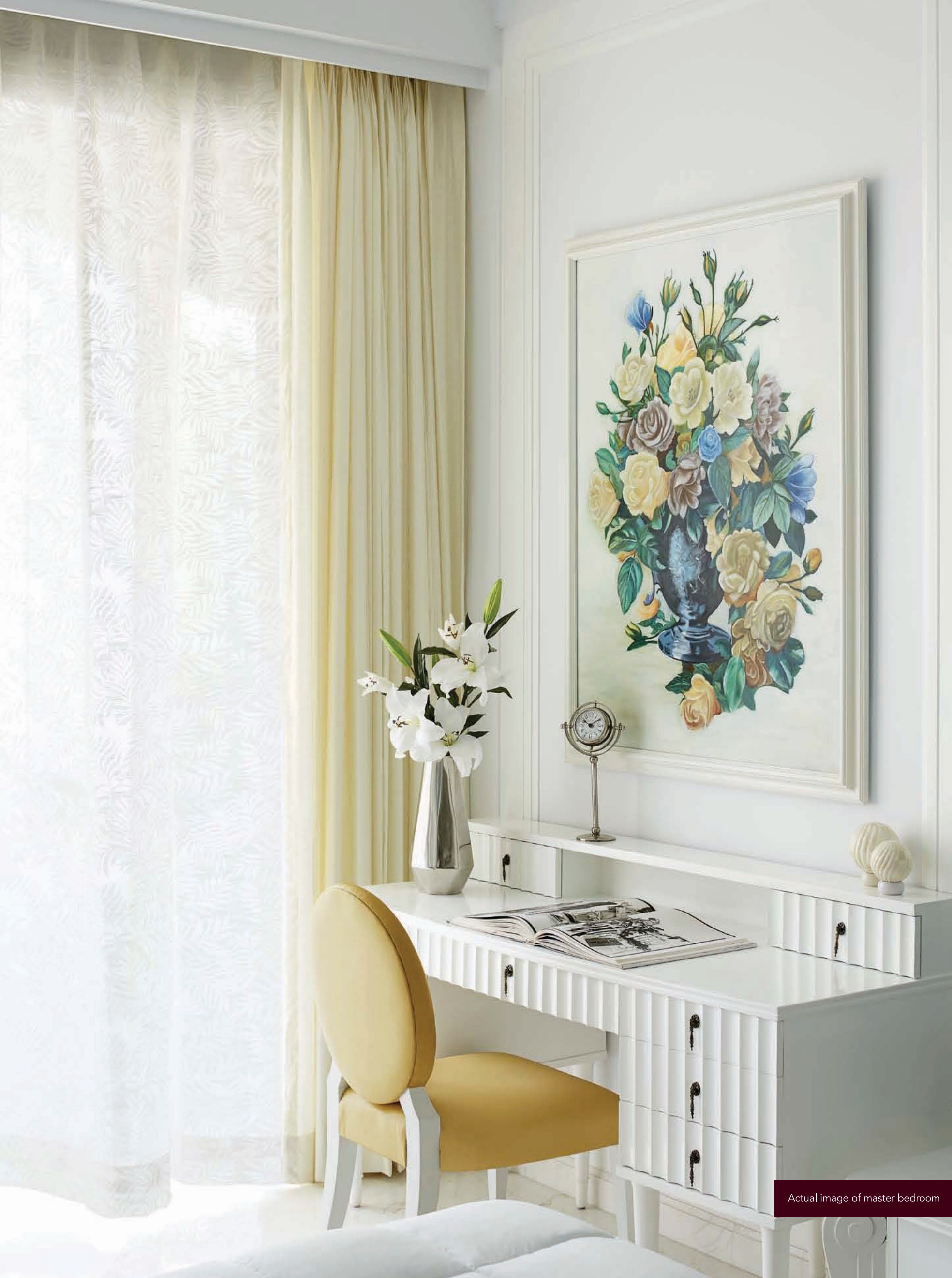
Actual image of master bedroom