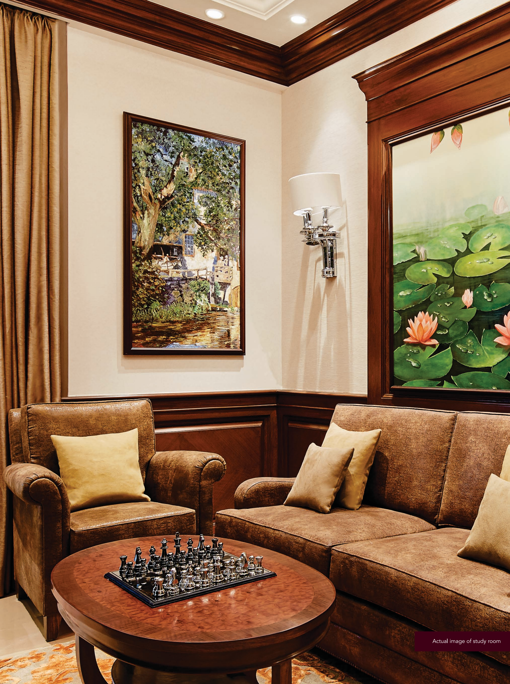
Actual image of study room