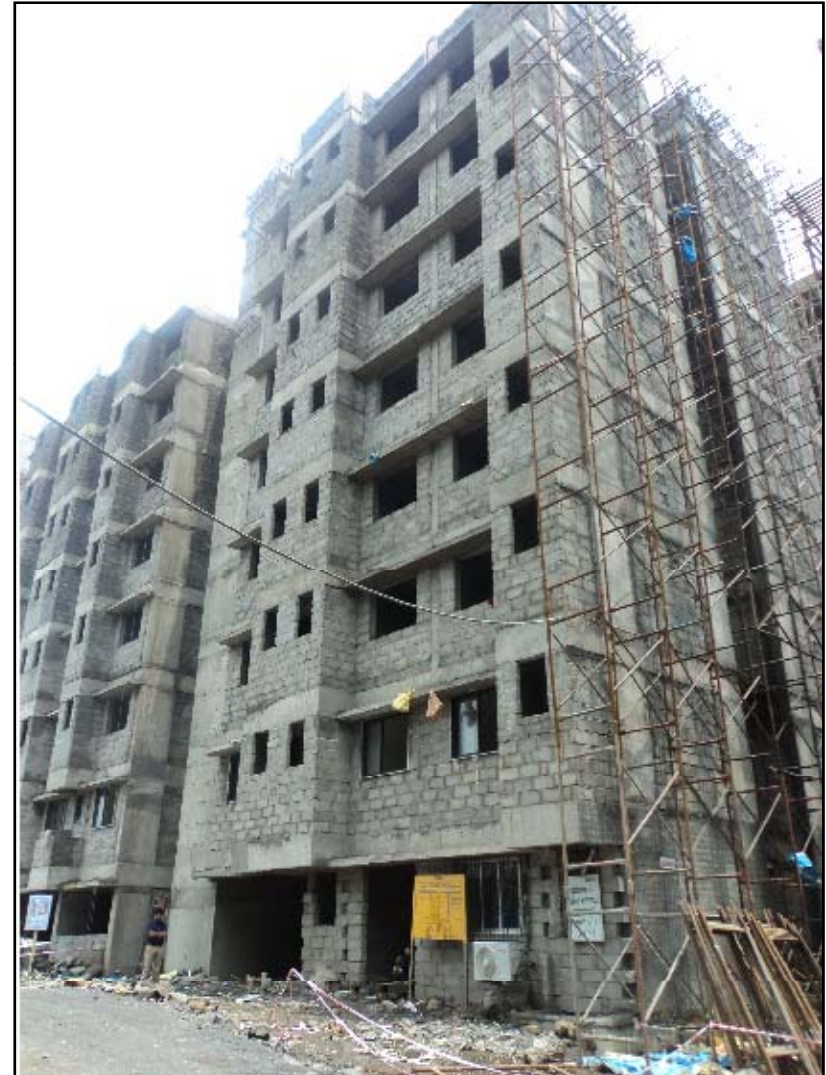
Indiabulls Greens, Panvel